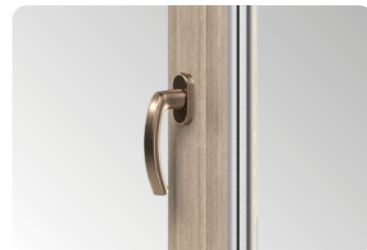
Elegant handle that emphasizes the window character.