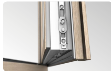
High quality Maco Multi Matic KS fitting with two anti-theft hooks as a fittings standard.