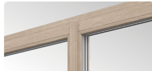
Slender profiles with a narrow post equipped with double seal which is a novelty in this kind of solutions on the market.